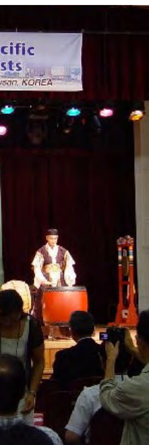
/ Western Pacific Regional

Possibly because of concerns about SARS (Severe Acute Respiratory Syndrome), the total number of attendants was 600, a little smaller than the last time. However, the quality of the science was as good as any at previous meetings. We had more than 100 renowned scientists as plenary lecturers and symposists, as well as about 310 posters. The exchange of scientific ideas and stimulating discussions occurred at every session. The opening ceremony featured Korean traditional music and dance performances creating a spirit of excitement that continued throughout the meeting. Warm good byes were exchanged at the farewell party, with the hope to meet again in Australia in 2007.