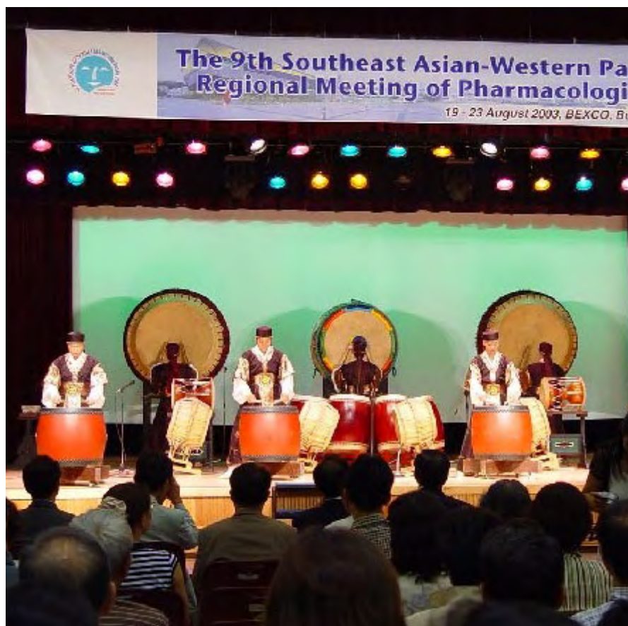
Traditional Korean drummers welcome the participants to the 9th Southeast Asian Meeting of Pharmacologists in Busan, South Korea.